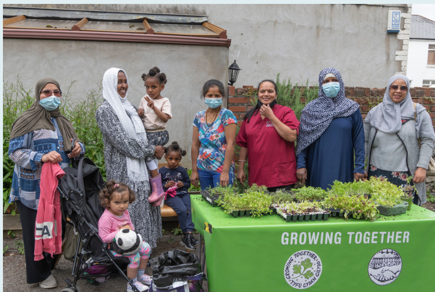
Volunteers gaining confidence, learning and having fun in SRCDC's Wyndham Street Centre.

The course provides opportunities to develop your ideas and speak up in a safe environment. Course participants will practice talking to an audience and demonstrating their skills.