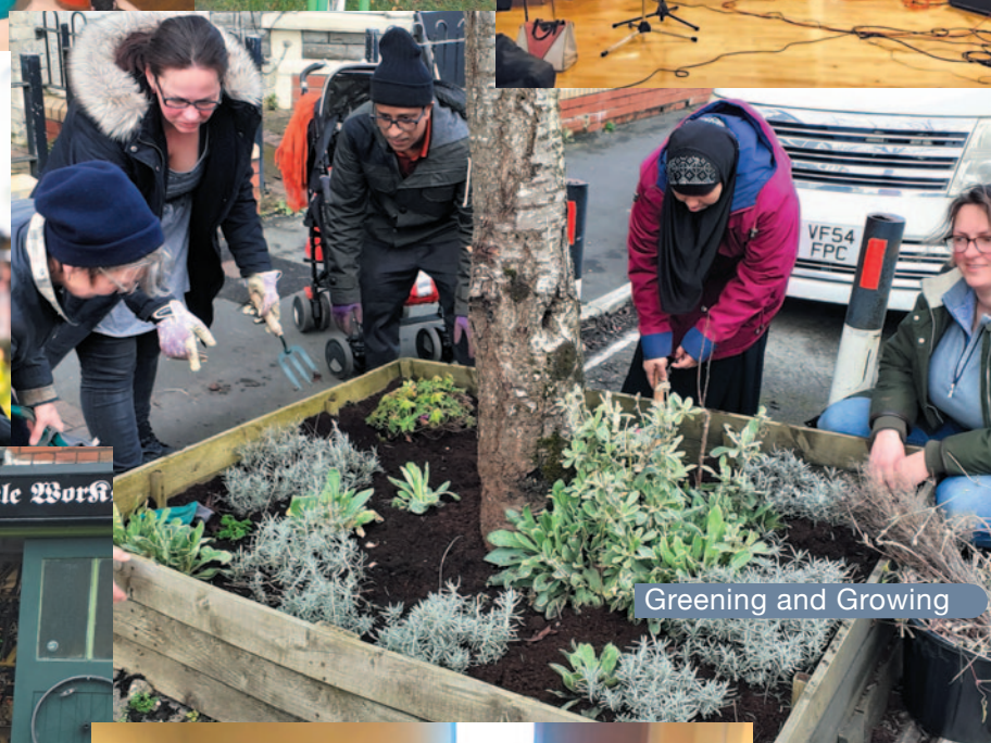
Greening and Growing