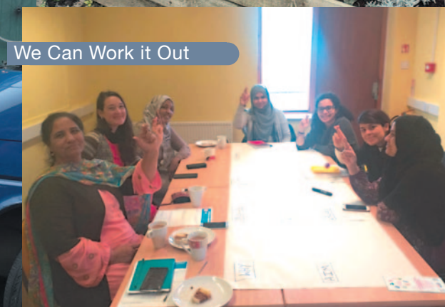
We Can Work it Out

For details of all our projects, project outputs and outcomes go to our website where you can watch podcasts from each Project Lead.