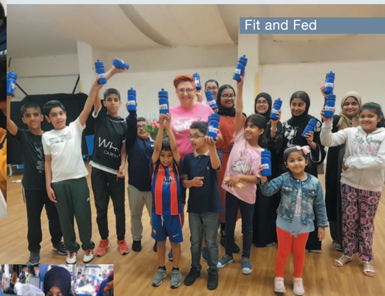
Fit and Fed